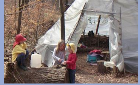
Social Institution „Waldkindergarten“