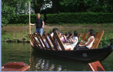
Punting trip (Tuebingen)