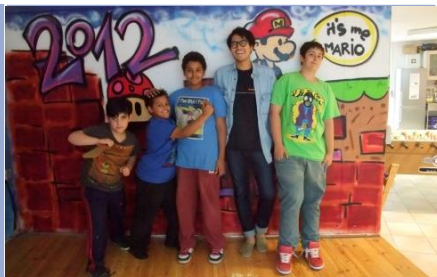
Social Institution „Youth Club“ (Nuertingen)