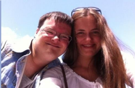
Social Institution „Behinderten-Förderung Linsenhofen“ (Oberboihingen)