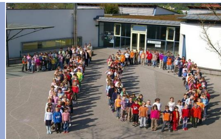
Braike elementary school