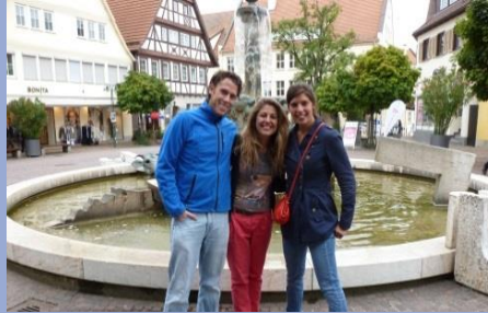
City Center Nuertingen