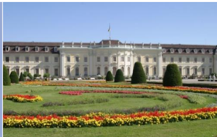
Castle Ludwigsburg (Germany)