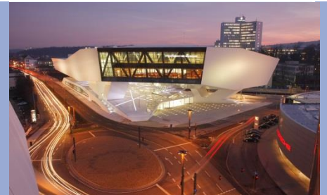
Porsche Museum, Stuttgart

_Wed July 05 _9:02 a.m. _9:00 a.m.-12:15 p.m. _1:10 p.m.-2:00 p.m. _2:30 p.m.-5:30 p.m.