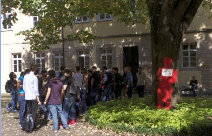
Inner courtyard of the university Nuertingen-Geislingen (HFWU)