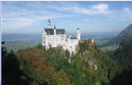
Castle Neuschwanstein (Germany)