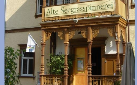
Restaurant "Alte Seegrasspinnerei" (Nuertingen)

*This program is for orientation and subject to change. Last updated October 19th, 2016. For more details and an ongoing updated program, please go to https://www.hfwu.de/ngu/ps-germany/