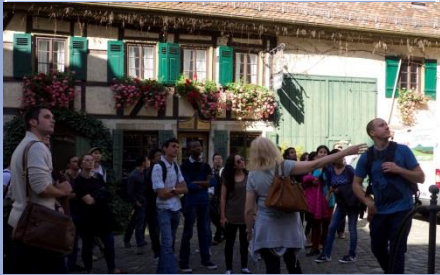
Guided city tour in Nuertingen