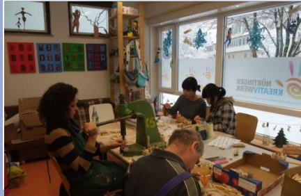
Social Institution "Kreativwerkstatt" (Nuertingen)