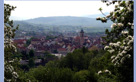
Panorama view Nuertingen