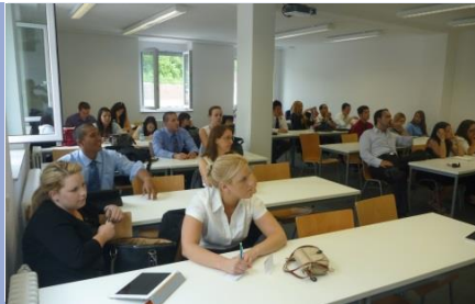
Lectures in Nuertingen