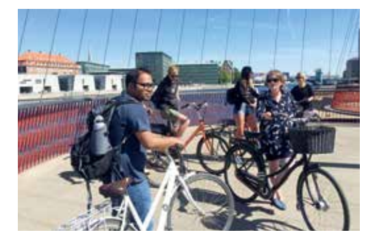
Experiencing "Sustainable Mobility" firsthand on an excursion t

The exacting but effective program is divided into five practice-oriented subject areas – Projects, International Planning and Design, Planning and Project Management, Information Technologies in Planning and Design, and Planning and Design Methods – and provides high-quality training aligned to labor market requirements, thus honing skills for which there is likely to be an increased demand in the future.