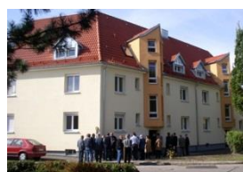
Kantstr.2/Eybacher Str. 52, Geislingen