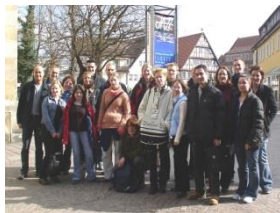
Tour of the town