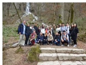
Waterfall Bad Urach