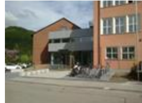
Campus Hauffstraße 13