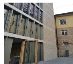
CI7 International Office/Library