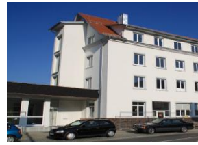
Campus Bahnhofstraße 37

In spring 2016 the private university Hochschule für Kunsttherapie (HKT) has been incorporated into NGU. From now on, we are also offering a bachelor degree program in Art Therapy, a bachelor degree program in Drama Therapy and a master degree program in Art Therapy.