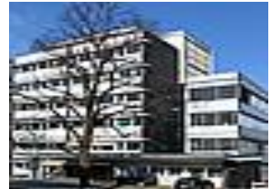
Campus Parkstraße 4