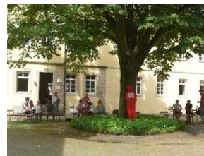
CI1-Ci6 City Campus