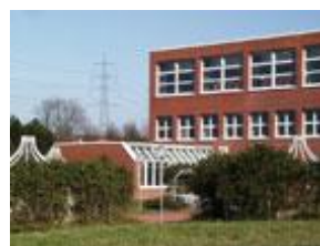
CB1-CB4 Campus Braike