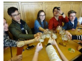
Gold Ochsen brewery

The orientation week does, however, not only mean paperwork and formalities, it is also much fun, e.g. during the welcome party, the campus and city tour, and the bus trip to an interesting place somewhere in Germany's south.