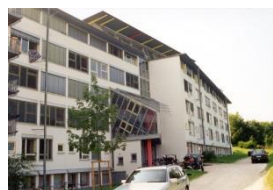
Schelmenwasen 10 Nürtingen

For exchange students only: Please note that payment can only be made after your arrival in Nuertingen/Geislingen. Do not make any payments from abroad. For the payment of the rent students have to sign a document (Einzugsermächtigung) which authorizes the Studentenwerk - the organisation responsible for the management of the residence halls and student restaurants - to withdraw the money for the rent from your bank account. This payment is due during the first week of every month. The deposit has to be paid after you have moved into your room and it will be refunded if you leave the room in good condition. This process can take up to three months after the end of the lease. Information about all the residence halls is available at Studentenwerk Tübingen-Hohenheim. Please note that you cannot move into the residence hall during the weekend and on public holidays.