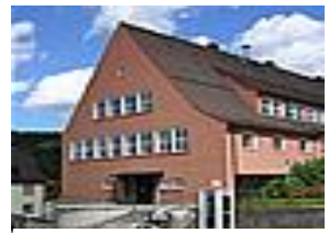
Campus Bahnhofstraße 62