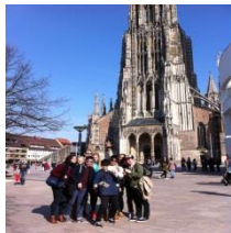
Ulm's Münster, tallest church steeple in the world